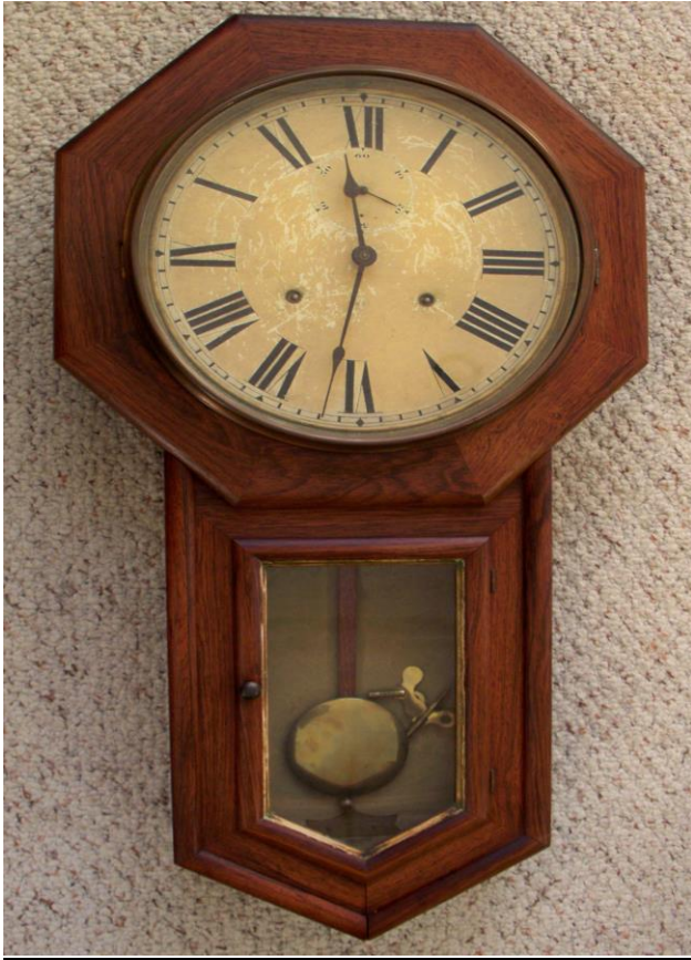
Clock is on display at the Turkeyfoot Historical building