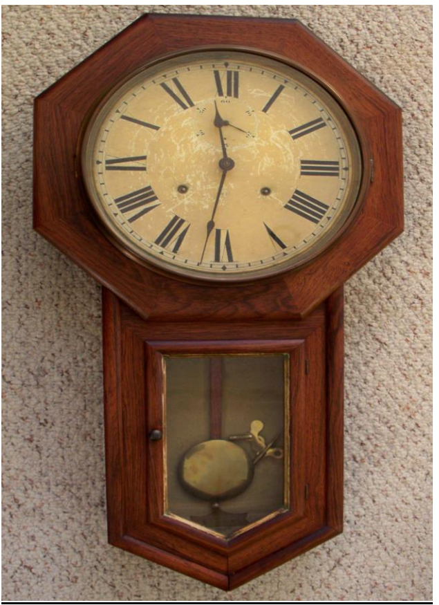
Clock is on display at the Turkeyfoot Historical building