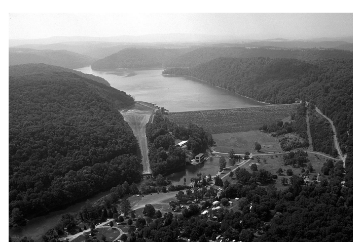
USACE Youghiogheny Lake Dam http://www.wikiwand.com/en/Youghiogheny_River

Pennsylvanians. The Commonwealth's waterways and lakes are home to bass, perch, shad, catfish, trout, and muskellunge, among others. https:// pafoodways.omeka.net/exhibits/show/farm/articles/fishing-on the-yough-river